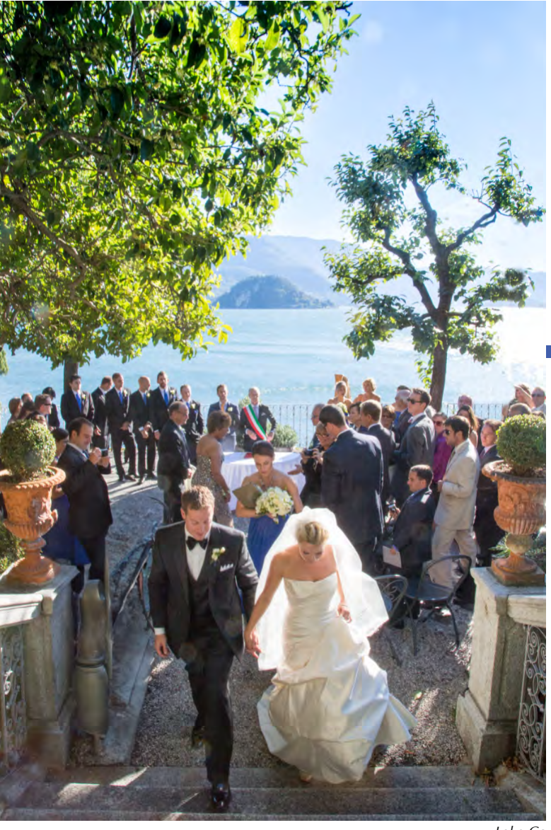
Lake Como, Italy