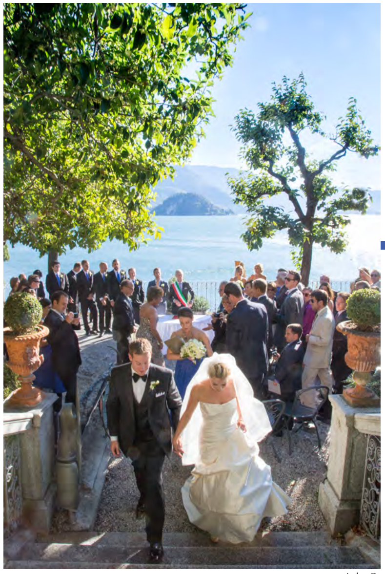
Lake Como, Italy