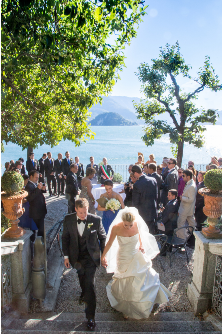
Lake Como, Italy